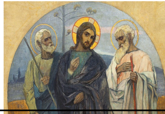
On the Way to Emmaus by Mikhail Nesterov