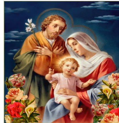
The Holy Family of Jesus, Mary & Joseph

Saturday - 5:00 p.m. Sunday - 6:45 a.m. & 9:30 a.m. Tuesday - 8:00 a.m. Wednesday - 5:30 p.m. Thursday - 8:00 a.m. Friday - 9:00 a.m. First Saturday - 8:00 am