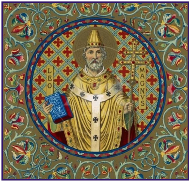
St. Leo the Great, Pope and Doctor of the Church Feast Day: November 10

Saturday - 5:00 p.m. Sunday - 6:45 a.m. & 9:30 a.m. Tuesday - 8:00 a.m. Wednesday - 5:30 p.m. Thursday - 8:00 a.m. Friday - 9:00 a.m. First Saturday - 8:00 am