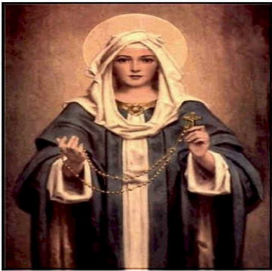
Our Lady of the Rosary Feast Day is Oct 7

Saturday - 5:00 p.m. Sunday - 6:45 a.m. & 9:30 a.m. Tuesday - 8:00 a.m. Wednesday - 5:30 p.m. Thursday - 8:00 a.m. Friday - 9:00 a.m. First Saturday - 8:00 am